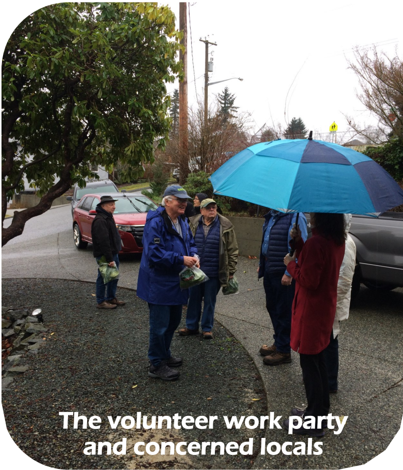
The volunteer work party and concerned locals

The loss of this magnificent landmark also captured the interest of other members of the ARS on Vancouver Island. Visitors from other chapters were there to observe and join in the discussion. On a positive note, those in attendance took many cuttings. Out of this