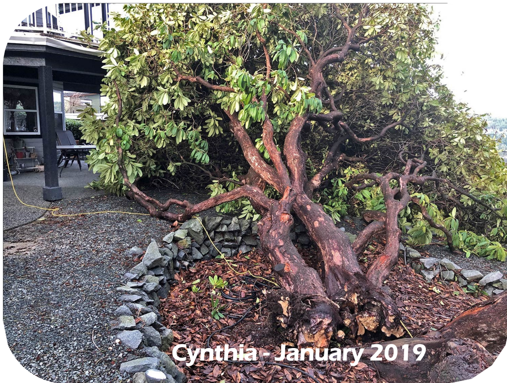
Cynthia - January 2019

Four knowledgeable and expert rhododendron aficionados from our society volunteered to look at the damage and offer