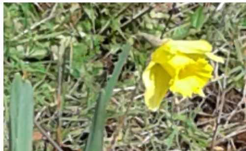
First Daffodil Jan 20, 2019

For our February, March and April meetings, you can earn a free ticket for a plant from our raffle table. There will be a section on the last page of the newsletter that will set up the criteria one must know to receive the free ticket. In order to get your ticket, write the answer on a folded piece of paper and give it to our ticket seller.