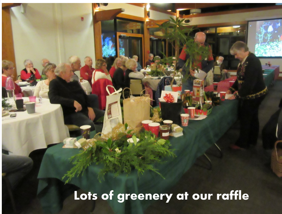
Lots of greenery at our raffle

Fortunately, some of Jacq-influenced greenery was available as table centerpieces and raffle swags and wreaths.